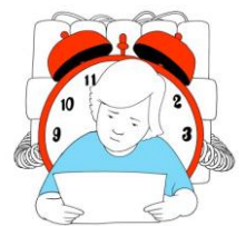
The Big Picture: Rethinking Dyslexia